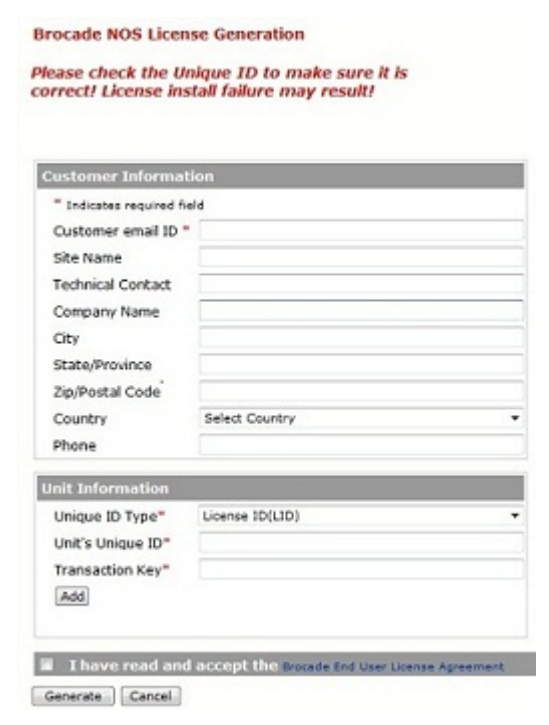
FIGURE 2 Brocade Network OS License Generation window

5. Enter the requested information in the required fields. An asterisk (*) next to a field indicates that the information is required.