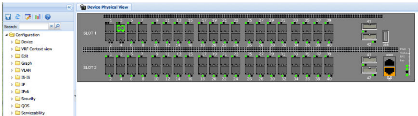
Figure 1: EDM window

The Device Physical View on your hardware can appear differently than the following example.