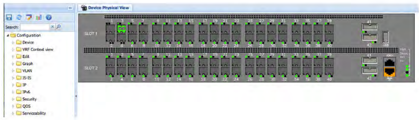
Figure 1: EDM window

The Device Physical View on your hardware can appear differently than the following example.