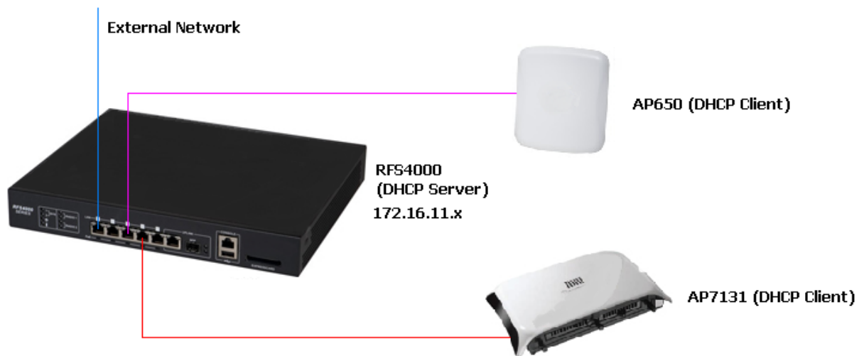
Figure A-1 Network Design

This section defines the network design being implemented.