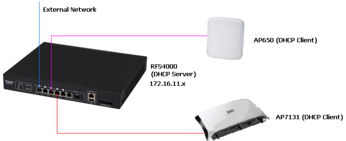
Figure A-1 Network Design

This section defines the network design being implemented.