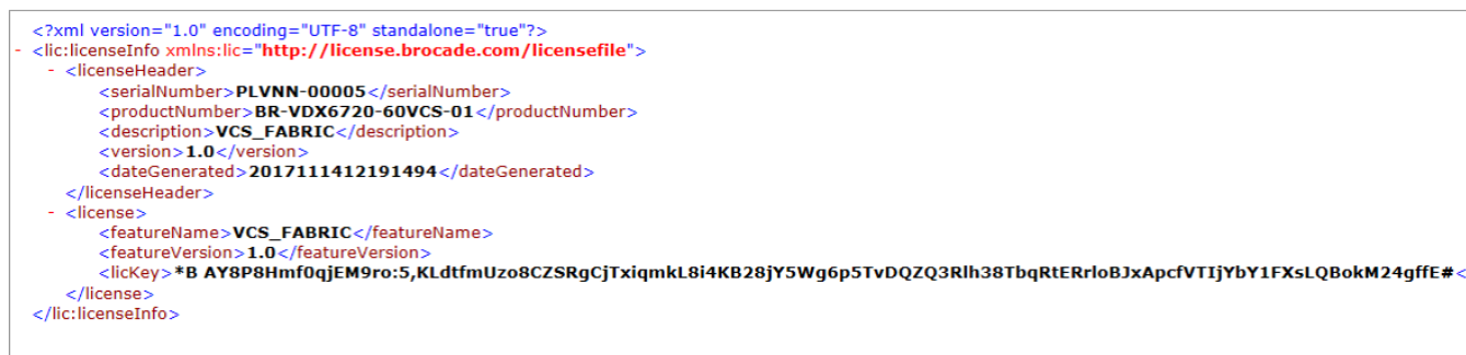
FIGURE 6 License file window