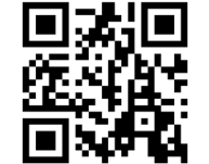
ExtremeCloud IQ Companion iOS Mobile Application