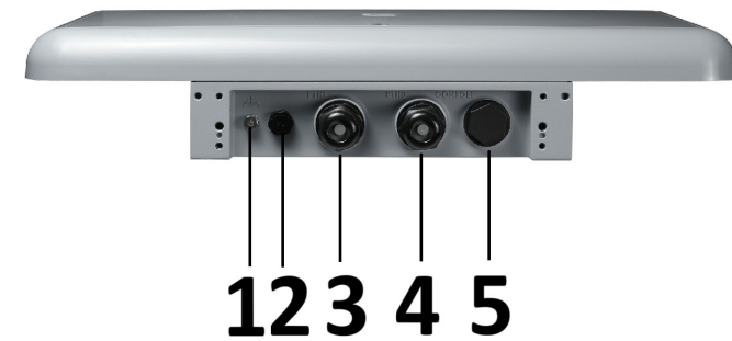
Table 1. AP5060D and AP5060U Ports and Connections