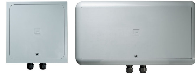
Fig. 1 AP5060D and AP5060U

The AP5060D and AP5060U have the following features and specifications. For more information, see the Data Sheet .