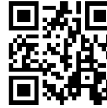
ExtremeCloud IQ Companion iOS Mobile Application