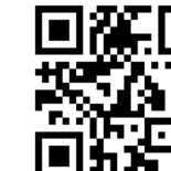
ExtremeCloud IQ Companion Mobile Application Onboarding