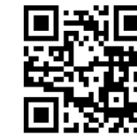
ExtremeCloud IQ Companion Android Mobile Application

Use your mobile device camera to scan the serial number, capture installation images, assign or change device location, and network policy. The ExtremeCloud IQ Companion Mobile Application enables you to access the device CLI for troubleshooting and view device and client status.