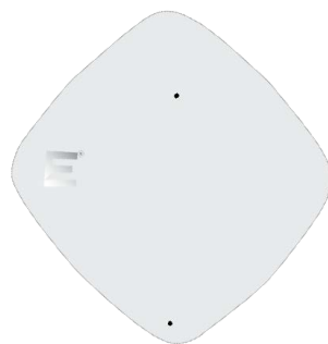
Figure 2 AP3000 access point hardware components