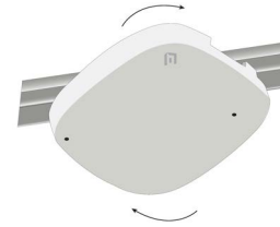
Figure 3 AP4000 or AP4000U access point ceiling install