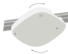
Figure 3 AP5010 access point ceiling install